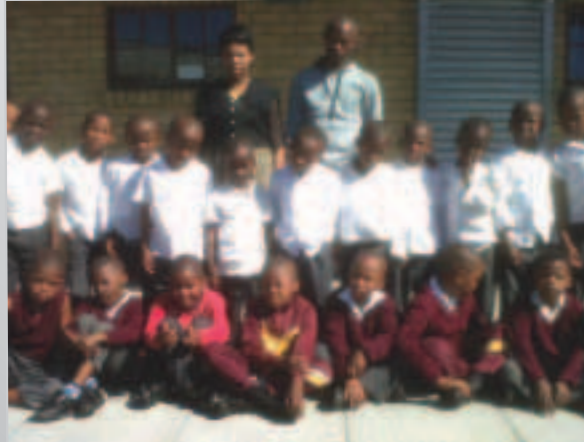
SAEP volunteers with a group of children from Siyazakha Primary School Amavolontiya ase-SAEP afundela izingane eSiyazakha Primary School

... miserable, boring and uninteresting.